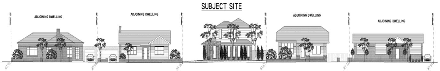
Example Streetscape elevation showing a proposed development in the context of two adjoining dwellings.

Disclaimer: This publication is produced by Moreland City Council and is intended for information and communication purposes only. Although the publication may be of assistance to you Moreland City Council does not guarantee that it is without flaw or is wholly appropriate for your particular purposes. It and its employees do not accept any responsibility, and indeed expressly disclaim any liability, for any loss or damage, whether direct or inconsequential, suffered by any person as the result of or arising from reliance on any information contained in the publication.