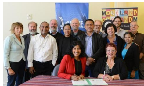
With Friends of Aileu representatives & Timor-Leste Honorary Consul