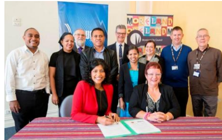
Timor-Leste visitors & staff mentors

In April Moreland and Hume City Councils each hosted two Timor-Leste public servants, members of a nine-person urban planning delegation, on 3-day work-based training placements, following the signing of the Municipal Agreements on 8 April.