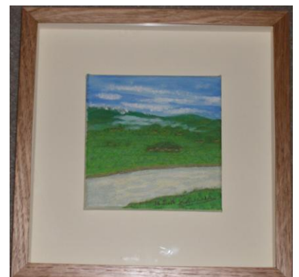
The painting by Xanana

The painting will be offered for auction at the Friends of Aileu Trivia Night at the Coburg Town Hall on 29 August.